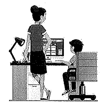
We appreciate the support from Parents!

2019-2020 ਯੀਅਰਬੁੱਕ: 2019-2020 ਦੀ ਯੀਅਰਬੁੱਕ ਹੁਣ ਦਫਤਰ ਵਿਚ 15 ਡਾਲਰ ਵਿਚ ਖ਼ਰੀਦਣ ਲਈ ਉਪਲਬਧ ਹੈ। ਜੇ ਤੁਸੀਂ ਯੀਅਰਬੁੱਕ ਲਈ ਪਹਿਲਾਂ ਹੀ ਭੁਗਤਾਨ ਕਰ ਚੁੱਕੇ ਹੋ, ਕਿਰਪਾ ਕਰਕੇ ਦਫ਼ਤਰ ਤੋਂ ਚੁੱਕਣ ਤੋਂ ਪਹਿਲਾਂ ਸਾਨੂੰ ਕਾਲ ਕਰੇ।