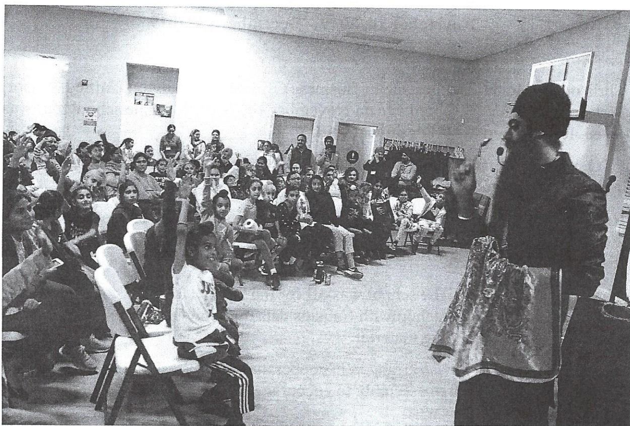
I PTO Magic Night November 15, 2019

School Safety: As there are so many incidents happening nationwide, schools are exposed to many unsafe conditions. SVCS is making efforts to keep scholars safe and prevent anything that endangers school kids' safety.