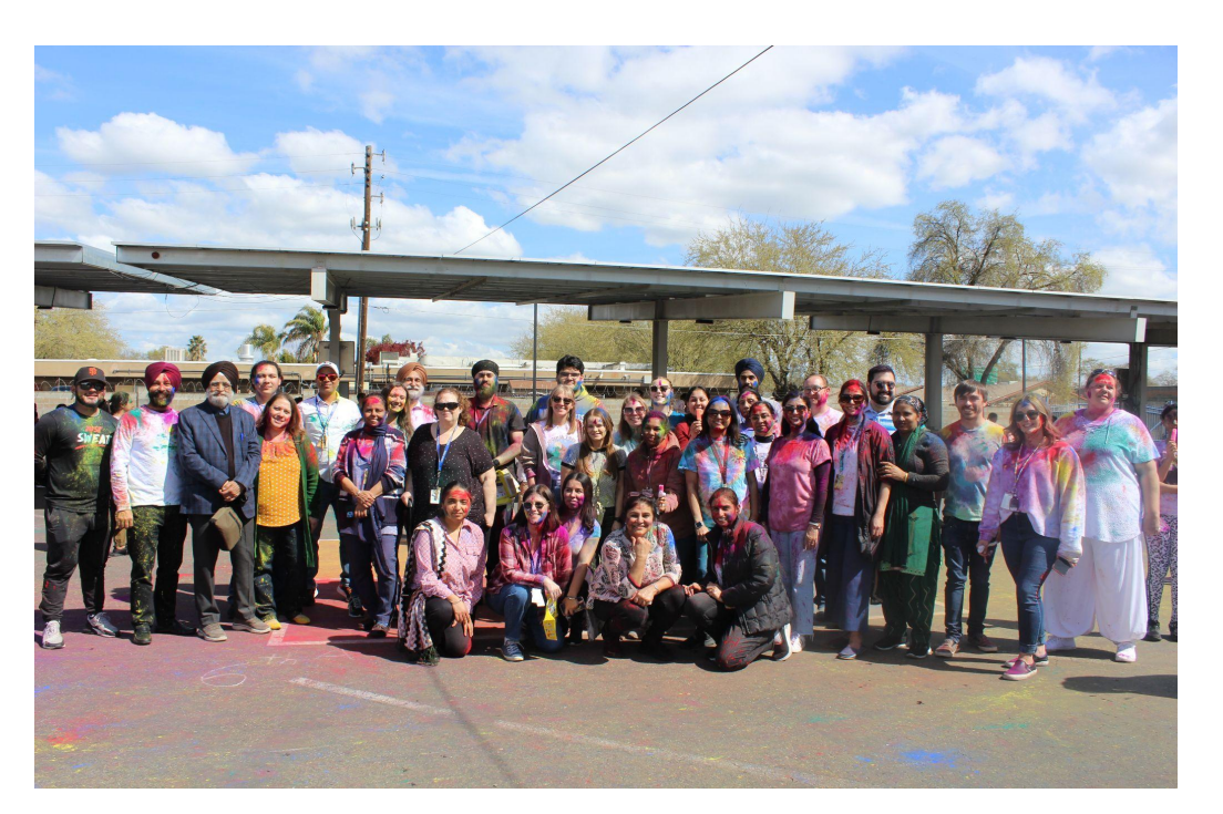
The SVCS staff showing their colors