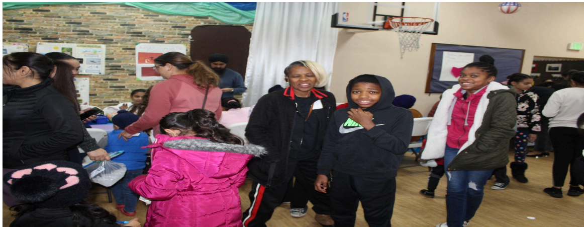
2023-2024 SVCS STEAM NIGHT

STEAM NIGHT: STEAM night was a massive success as parents, faculty, scholars, and staff gathered to see what the scholars had accomplished this year. Thank you to our parents who came in large numbers to the STEAM night. The scholars and teachers had incredible experiments, activities, and the robotics team corner. STEAM night was the most successful event Sacramento Valley Charter School has ever hosted. We want to thank everyone who helped and came to help celebrate this day and everyone for making this a very successful gathering for the school and the scholars.