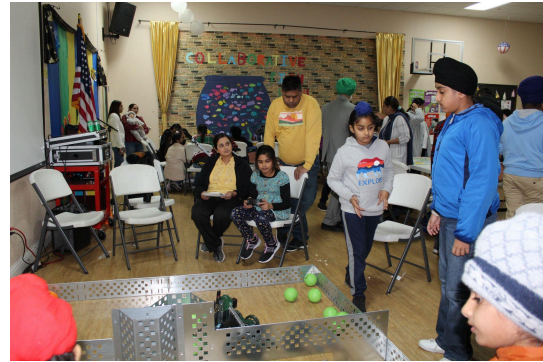
STEAM Night 2022

Award Assembly - We recognize our scholar's accomplishments during the award ceremony. On Dec 19, 2023, outstanding scholars were honored in the presence of their parents and their peers. Scholars were awarded Principal's Honor Roll and Honor Roll as well. The next awards assembly will be held on February 14, 2024.