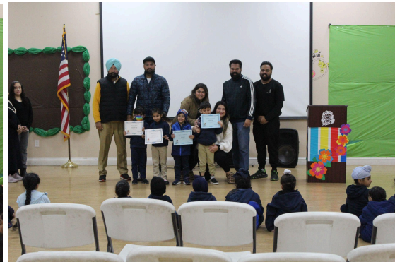
December 2023 Awards Assembly