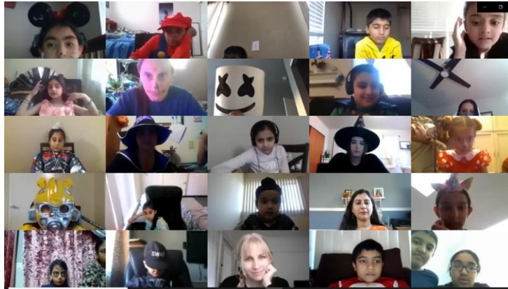
SVCS scholars engaged in the virtual Halloween event

EL Support Extended Hours: Based on the recent survey sent to the parents of all EL students 82% of the answers indicated that you would have your EL student participate in the extended hours for English language support. SVCS is coordinating with the English Language Development teachers to create a schedule, more information about the EL program will be available soon.