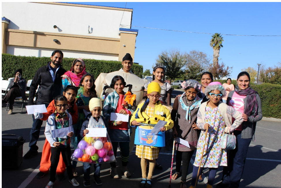
Winners of the Annual SVCS Halloween Parade