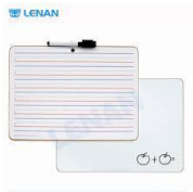
Double sided dry erase board