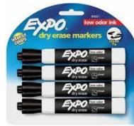
2-3 dry erase markers