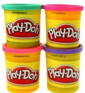
2-3 containers playdoh